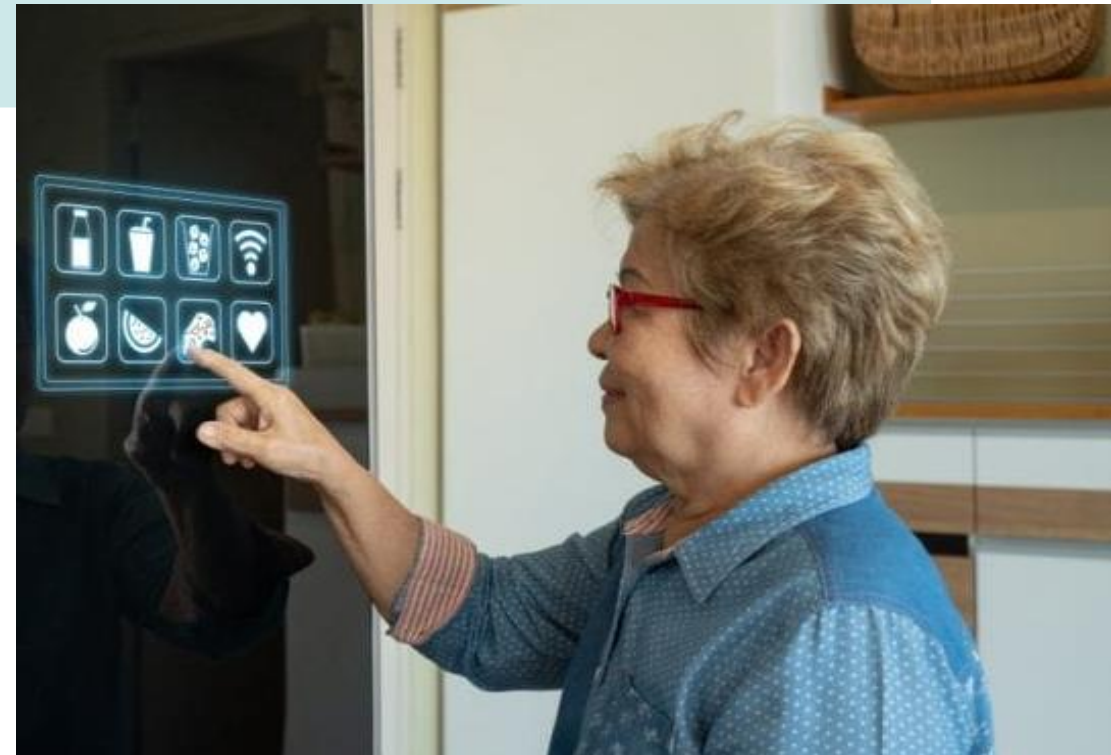
PYMNTS.com (2020) The senior factor in Smart Home Innovation, Pymnts.com. Available at: https://www.pymnts.com/innovation/2020/the-senior-factor-in-smart-home-innovation/ (Accessed: 15 August 2023).